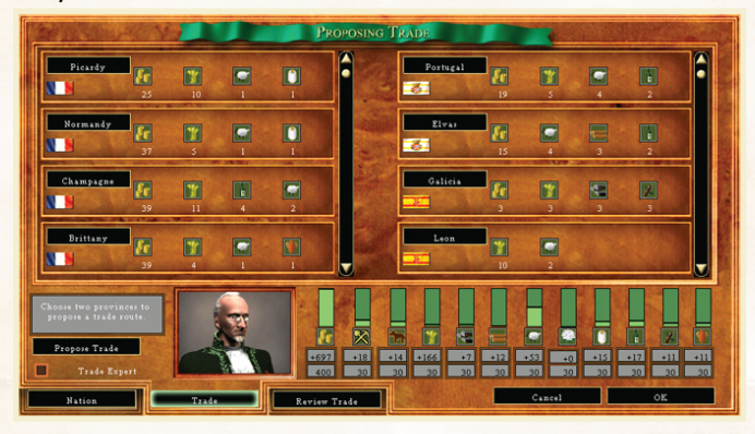
Trade Expert – The Trade Expert checkbox, which can be toggled on to automate trade, is found toward the lower-left corner of the screen.

Note that in PBEM games trade offers made by players are accepted or rejected automatically, based on their merit and any national priorities established using the Set Policy command.